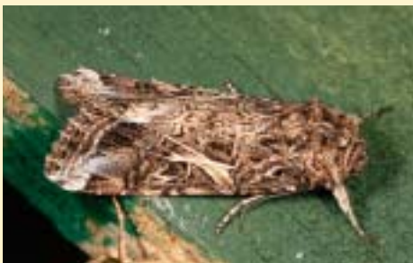
Yellow-striped armyworm moth