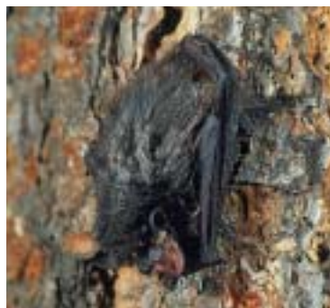
The opposite page shows a little brown bat roosting at Soudan Underground Mine State Park. This page, clockwise from top left: big brown bat, northern myotis, tri-colored bat, silver-haired bat, eastern red bat, and hoary bat.

CLOCKWISE FROM TOP LEFT: © GJSBERT VAN FRANKENHUYZEN, DEMBINSKY PHOTO ASSOCIATES. ©MERLIN D. TUTTLE, BAT CONSERVATION INTERNATIONAL. TIM KRYNAK, USFWS. © BRUCE MONTAGNE, DEMBINSKY PHOTO ASSOCIATES. ©MERLIN D. TUTTLE, BAT CONSERVATION INTERNATIONAL. © ALAN G. NELSON, DEMBINSKY PHOTO ASSOCIATES.