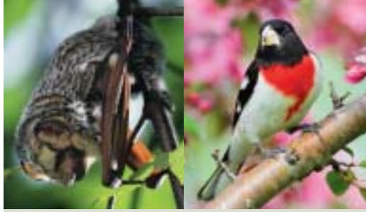
LEFT: HOARY BAT, RIGHT: ROSE BREASTED GROSBEEK